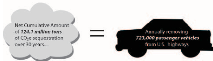
Figure 4. Urban Forest Products CO 2 e Sequestration and Comparison to U.S. Automobiles

In Table 2, net cumulative sequestration is estimated with a fixed urban forest size (0% growth) and three different utilization rates (sequestration potential): the baseline of 0.1% (10% use of 1% removals), and 0.2% (20% of 1%) and 0.3% (30% of 1%). This scenario represents growth in the urban forest products industry as the level of utilization increases with a fixed “size” of the urban forest. At a 0.2% utilization rate net CO 2 e sequestration by the end of 30 years has doubled from the baseline amount of 124.1 million tons to 248.1 million tons. At a 0.3% utilization rate, net CO 2 e sequestration has tripled to 372.2 million tons.