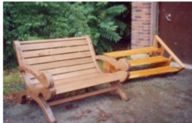
Figure 1. Benches made from public park trees in Cincinnati.

The unique qualities of lumber from urban trees (as noted above) and the existing NHLA standards can be used in a complementary way. Combining the two ways of “judging” urban lumber should raise the urban wood recovery factor (increase product output). This in turn would lead to additional carbon storage, especially if the manufactured products were “long-term” such as flooring, furniture, building materials or keepsake works of art.