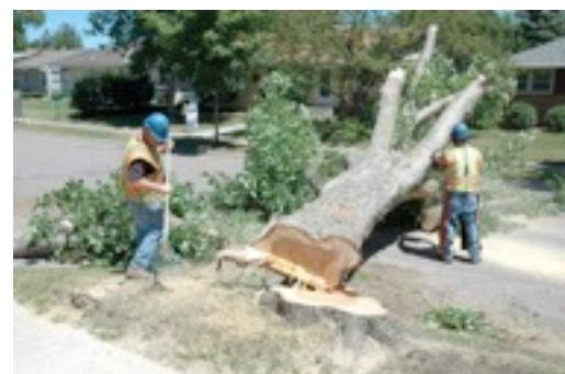
Figure 3. Tree removal in Minneapolis.

Updating the work of Birdsey (1996), Smith et al. (2006) created look-up tables for forest and harvested carbon stocks that include estimates of the proportions of tree carbon that end up